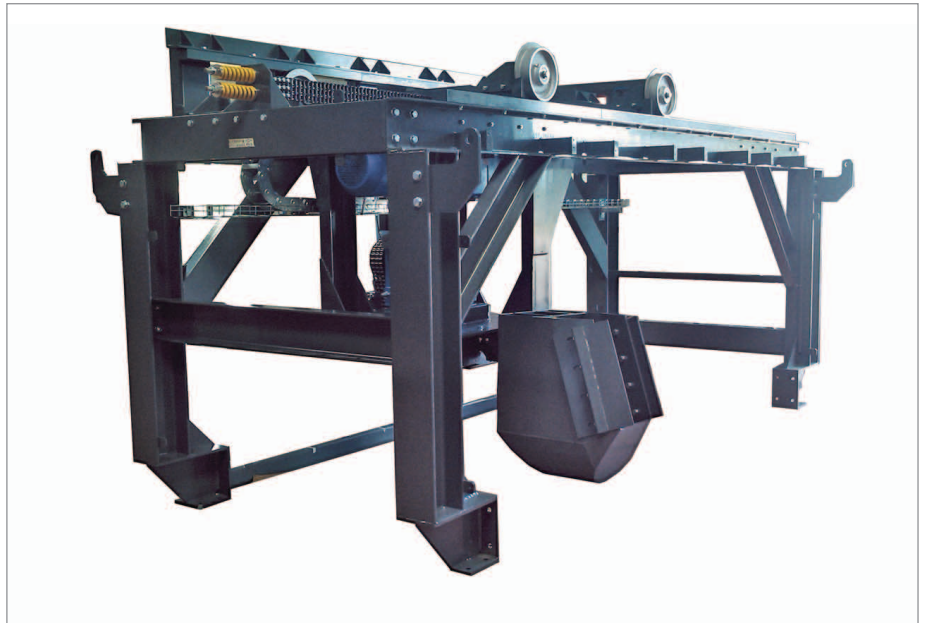
An example of a linear sampler at the belt's discharge point with bucket or spoon (according to application)

A flow or a product is homogeneous when all the particles are strictly identical. Unfortunately, homogeneity cannot exist in the majority of solid bulk industries. That is why we have to